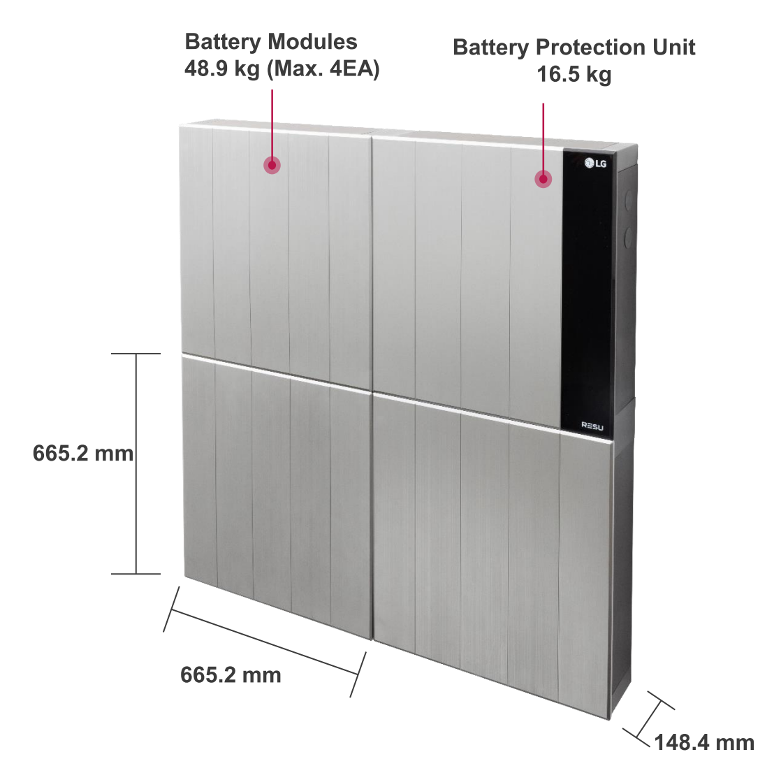
*Drawings are with design covers